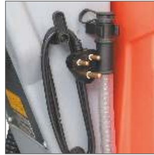
Comes with onboard charger as standard. Can be charged at any available plug socket.