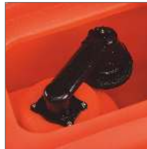
Easy tank cleaning, thanks to the large tank opening. Tank can be emptied quickly and easily via the large outlet hose. Overflow protection for the dirty water tank.