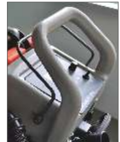
Pad holder available as option