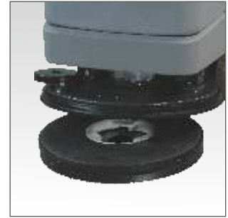
Brushes can be changed quickly without the need for any tools at the push of a button.