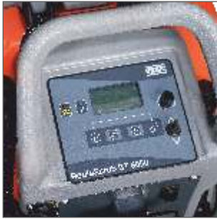
Ergonomic handle for operators of any height. Excellent view of the area to be cleaned. Soft touch buttons for selection of operation. LCD panel with display of hour meter, battery level.